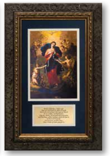
Matted with Personal Prayer