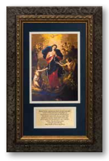
Matted with Marriage Prayer

NW-927A17 5.5x8.5 $24.00 NW-927D17 10x16 $50.00 NW-927F17 14x22 $100.00